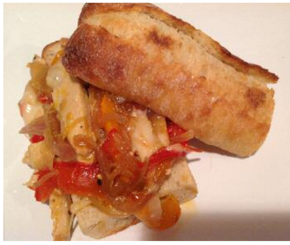
Chicken Philly Cheese(steak) sandwiches